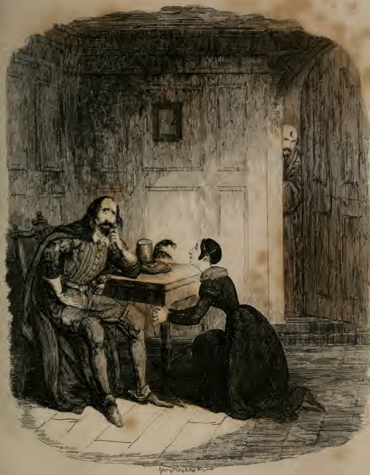
General Pitt-Rivers visiting the sick and wounded at the Campagna